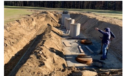
Above: Septic tank installation.