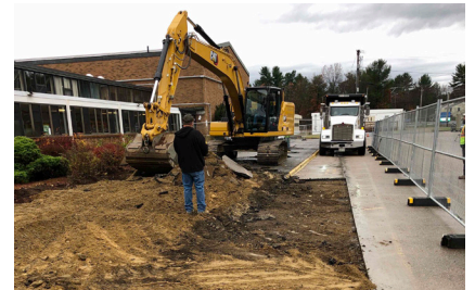
Above: Site work at front entry.