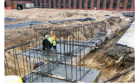
Above: Poured footings for gymnasium area addition